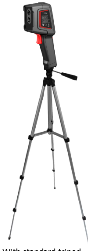
With standard tripod interface, can be equipped with customer's own tripod.

GUIDE T120H Fever Screening Thermal Camera is a fast temperature detection tool, which can be used to detect human temperature from a safety distance with accuracy of \pm 0.5^{\circ}\text{C} . It is an economical and practical thermal camera that could meet the needs of primary temperature screening well. With two intelligent temperature screening modes, GUIDE T120H is not only suitable for flexible temperature screening, but also can be deployed at the entrances and exits of the public area, which makes it an ideal device to improve the efficiency of epidemic prevention and protect public health.